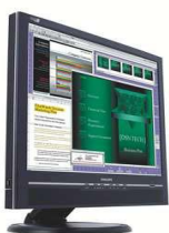
PHILIPS 19" 190S7FB LCD Monitor