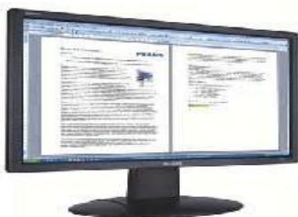
Philips 20" 200WS8FB LCD Wide Screen Monitor

Did you Know you can access Acclaims newsletters on our website? There you will find an archive of all our newsletters from current and past months. Its especially good if you have misplaced your newsletter and want to see our current specials, Promotions, and tips. Also don't forget our monthly Exonet Tips and Tricks that may come in handy down the track! Just visit: www.acclaimgroup.co.nz And go to the news section on the menu bar.