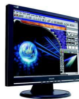
PHILIPS 17" 17S77B LCD Monitor