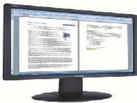
Philips 20" 200WS8FB Wide LCD Monitor

BUY IN JUNE AND GET IT FOR ONLY: $390 + GST