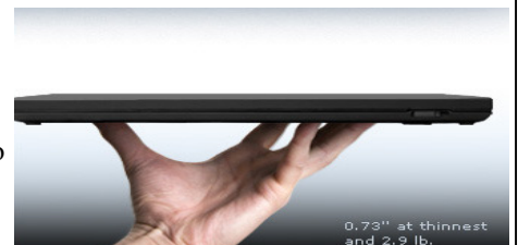
0.73" at thinnest and 2.9 lb.