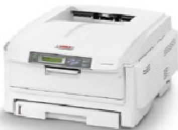
OKI C5650n A4 Colour Network LED Printer

BUY IN JUNE AND GET IT FOR ONLY: $390 + GST